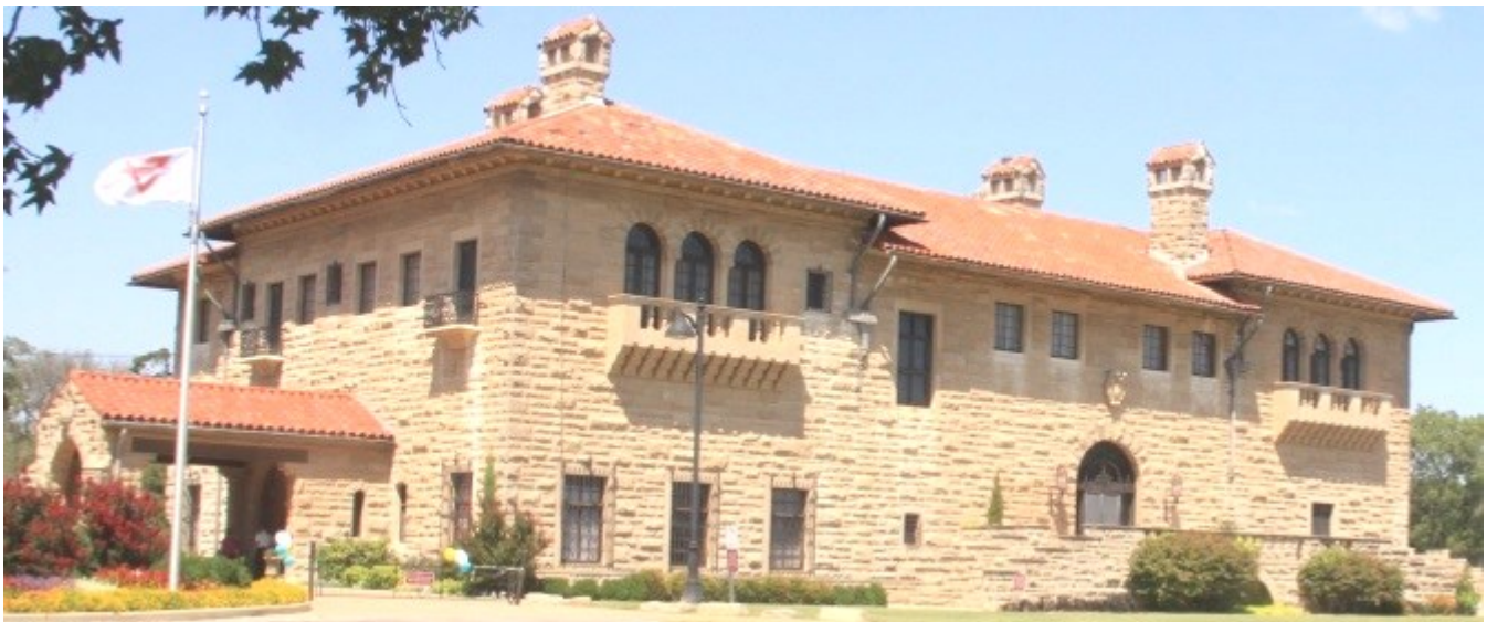
MARLAND MANSION, PONCA CITY, OK.