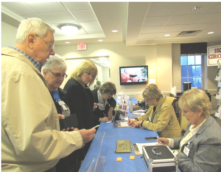
Thanks to our Hospitality Team, check-in went very smoothly and quickly!