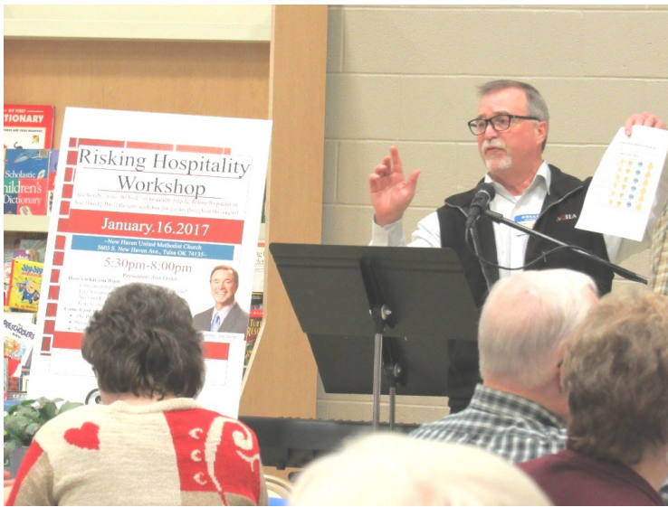
The participants had a moment to “grade” their church in several areas of hospitality.