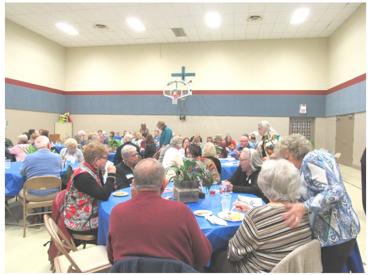
Everyone enjoyed a wonderful catered Mexican meal!