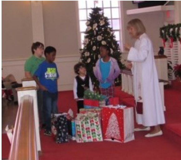
BLESSING OF THE ANGEL TREE GIFTS ON DECEMBER 6TH