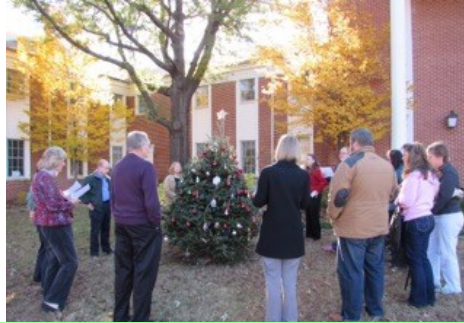
DECORATING THE MEMORIAL CHRISTMAS TREE ON DEC. 6th