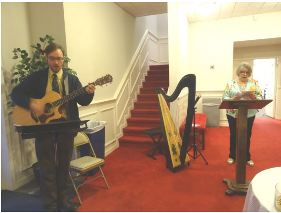
SUNRISE EASTER SERVICE