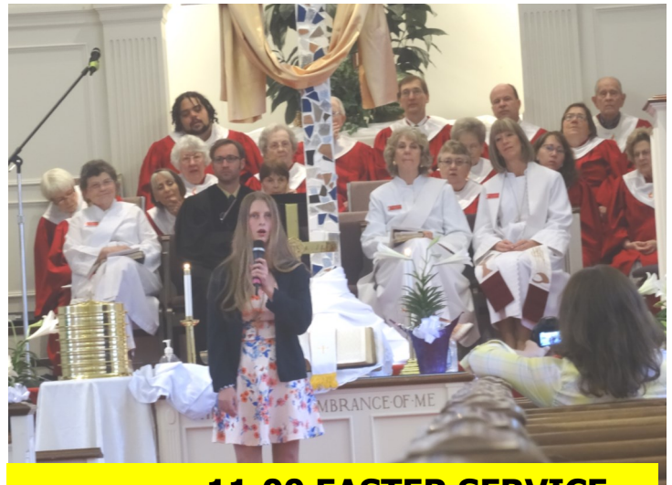
11:00 EASTER SERVICE