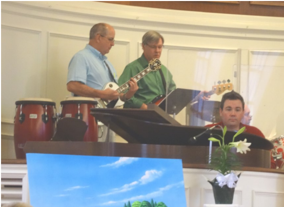
8:45 A.M. EASTER SERVICE