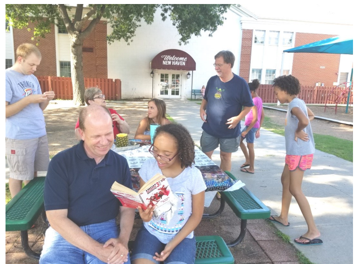
Respite Care on Saturday, July 8th