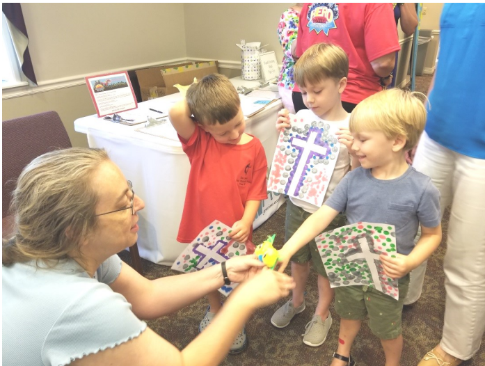
Children's Church on Sunday, July 9th