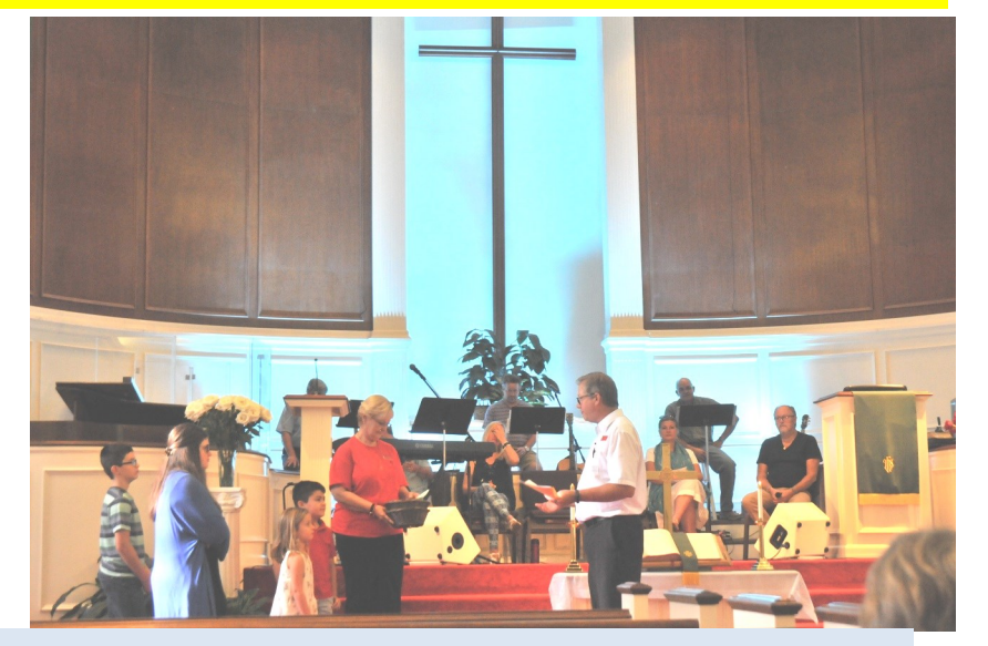
ANNUAL "BLESSING OF THE BACKPACKS" DURING BOTH SERVICES ON AUGUST 20TH