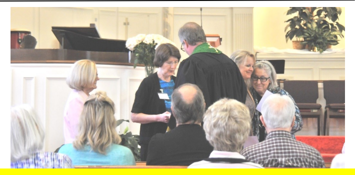
PRESENTATION OF CERTIFICATES TO THE DISCIPLE I GRADUATES ON SUNDAY, AUGUST 20TH