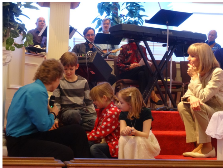
Children's Moment during worship on March 8th